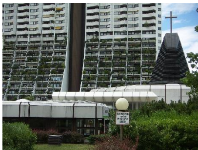
Wohnpark Alt Erlaa, Church