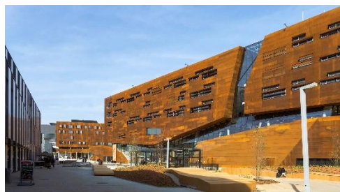
Vienna University of Economics and Business