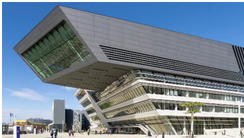
Vienna University of Economics and Business